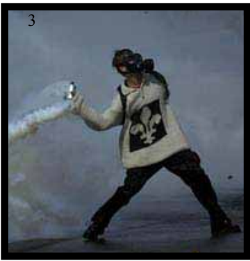
Tear gas canisters can be thrown away from the crowd, but be careful. They are extremely hot, and can burn your hands.

to intimidate and scare people away; Surprise attacks by troops hidden in reserve; Surround and Isolate Entire Crowds – Sometimes not allowing people to leave or enter.